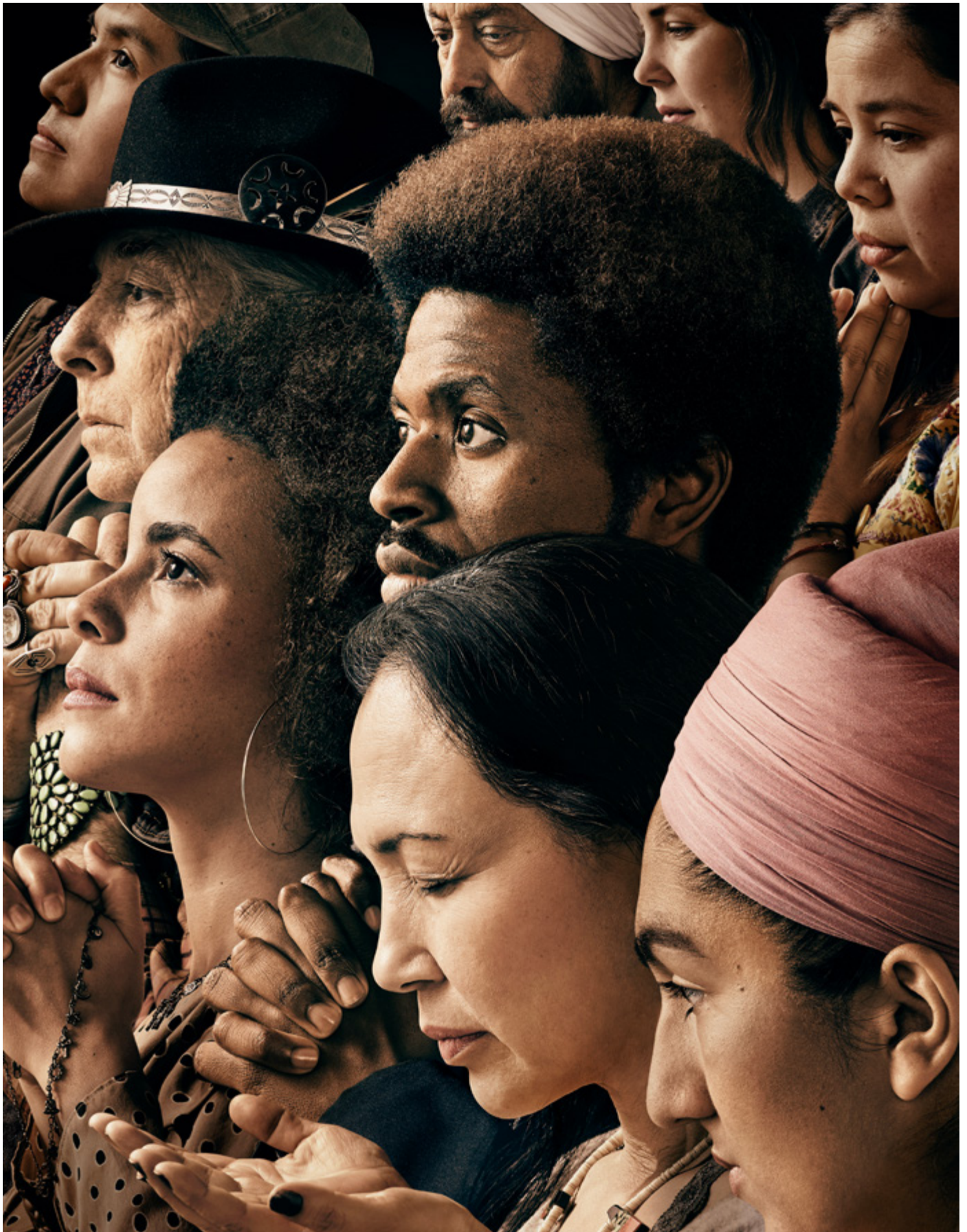
Freedom of Worship