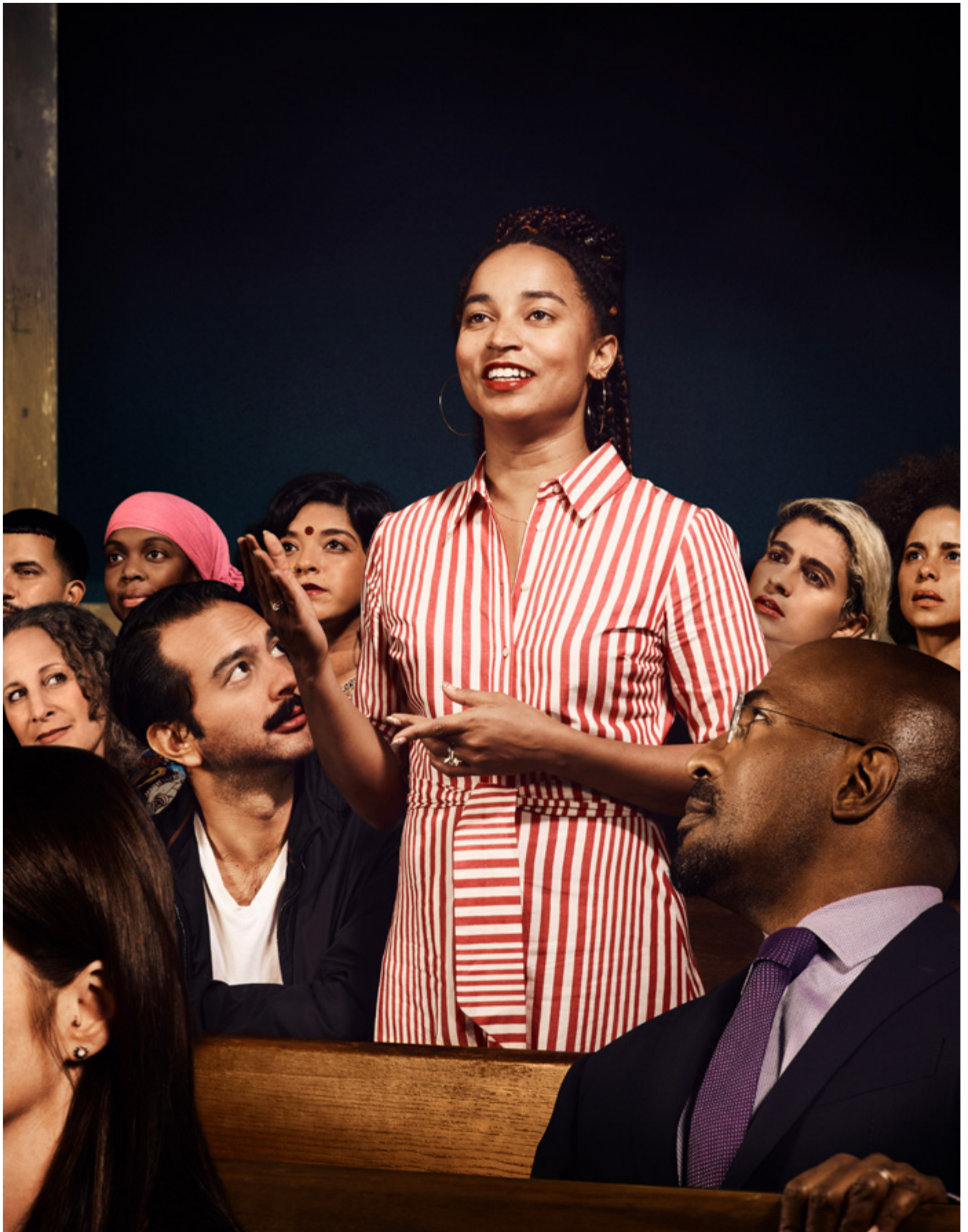
Freedom of Speech