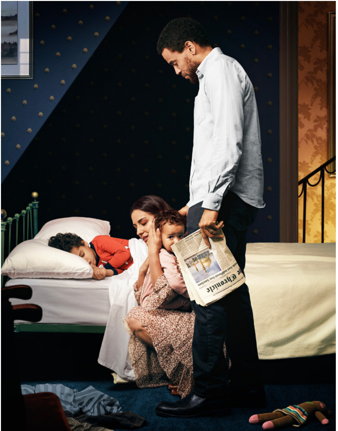
Freedom from Fear CREDIT: FOR FREEDOMS (HANK WILLIS THOMAS AND EMILY SHUR IN COLLABORATION WITH ERIC GOTTESMAN AND WYATT GALLERY OF FOR FREEDOMS), "FREEDOM FROM FEAR," 2018