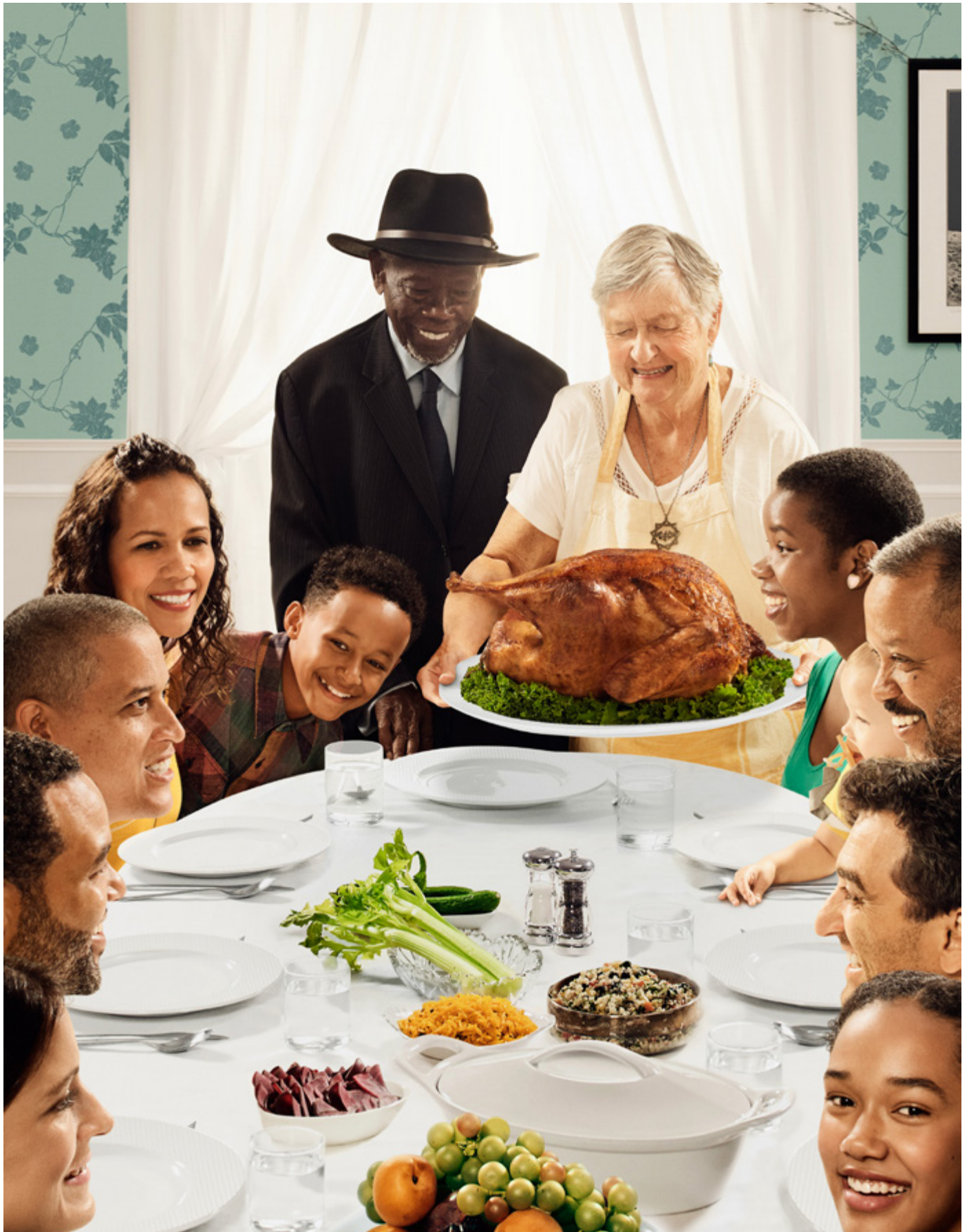
Freedom from Want